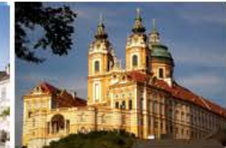
Oberösterreich – Linz