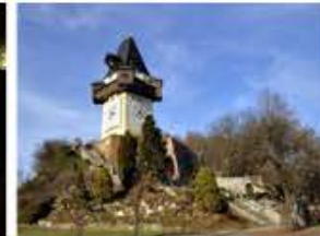
Steiermark – Graz