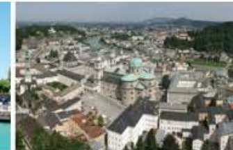
Salzburg – Salzburg