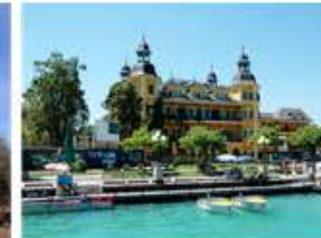
Kärnten – Klagenfurt