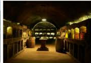
Burgenland – Eisenstadt