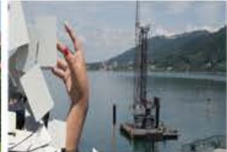
Vorarlberg – Bregenz