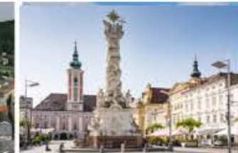
Niederösterreich – St. Pölten