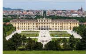
Wien – Wien