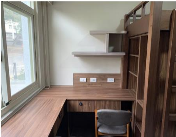
Pine House II Room Interior View (2)