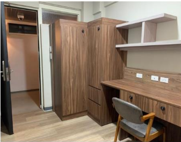
Pine House XII Room Interior View (1)