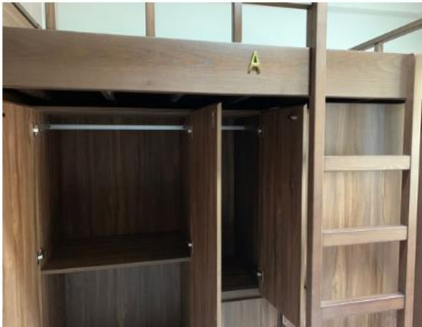
Pine House II Closet