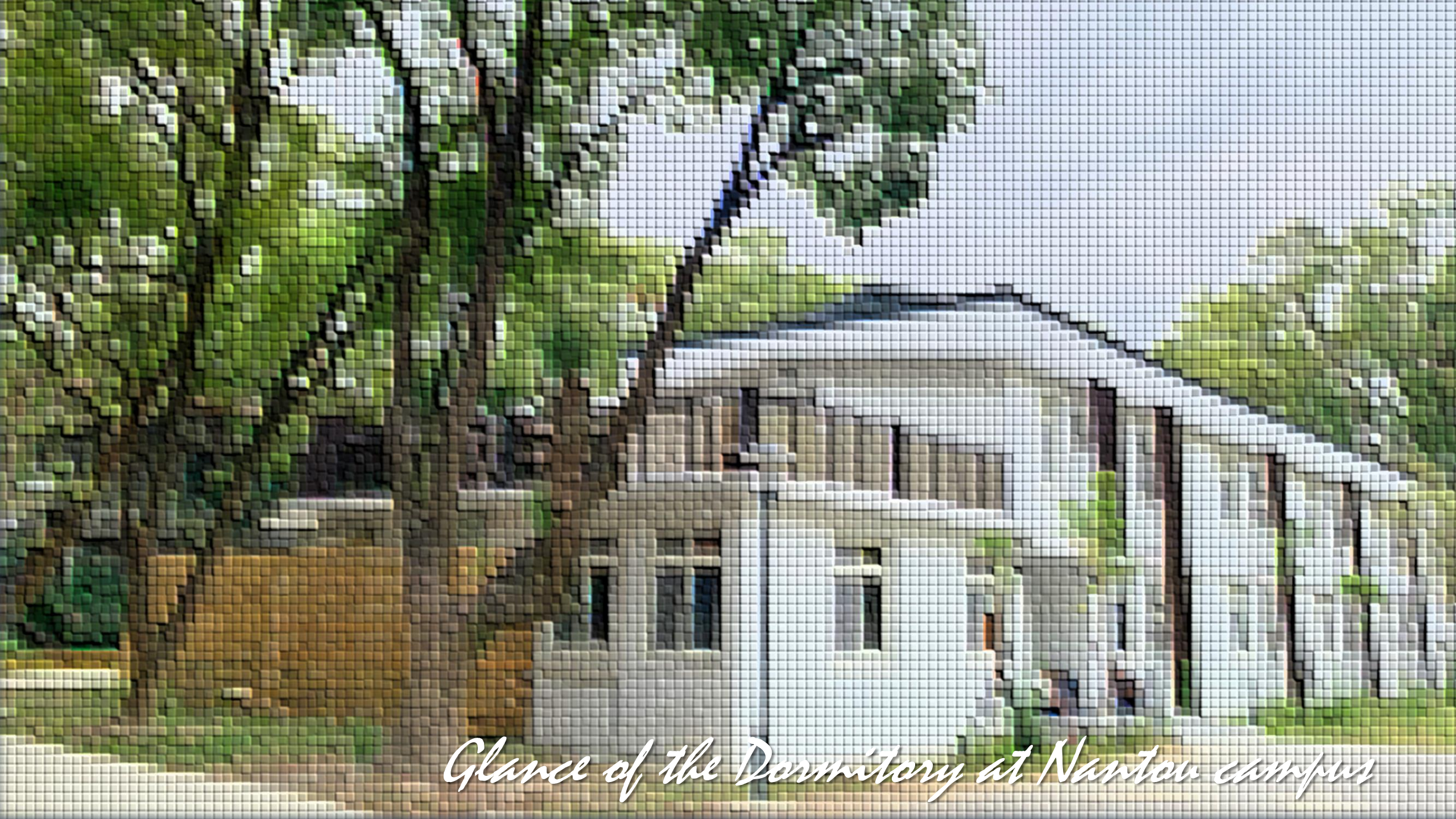
Glance of the Dormitory at Nanton campus