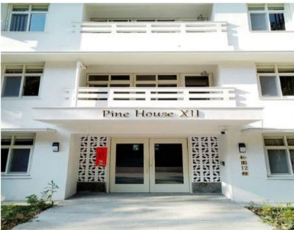
Pine House XII Main Entrance and Building