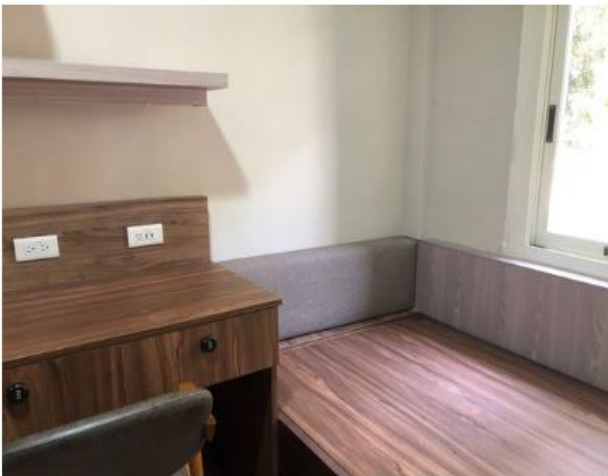
Pine House XII Room Interior View (2)