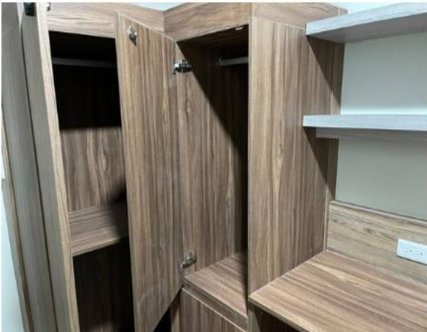
Pine House XII Closet