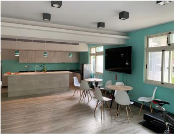
Pine House XII Public Space View (2)