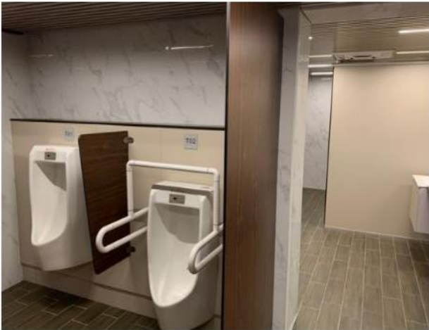
Pine House XII Public Space View (2)