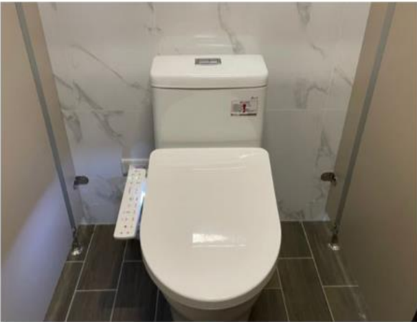
Pine House II Public Space View (1)