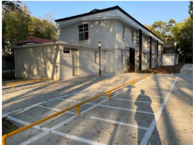
Pine House XII Parking area