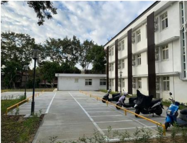
Pine House XII Parking area