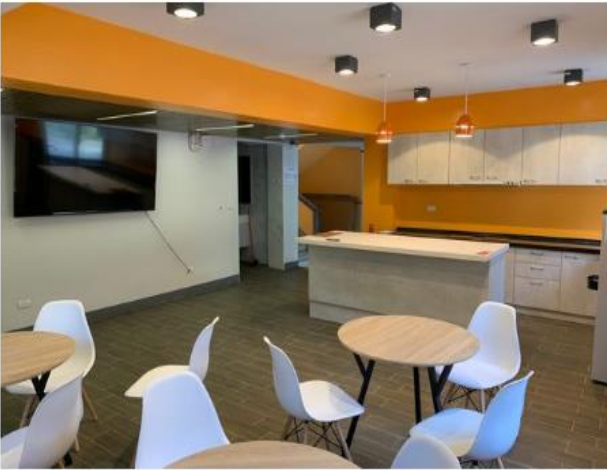
Pine House II Public Space View (2)