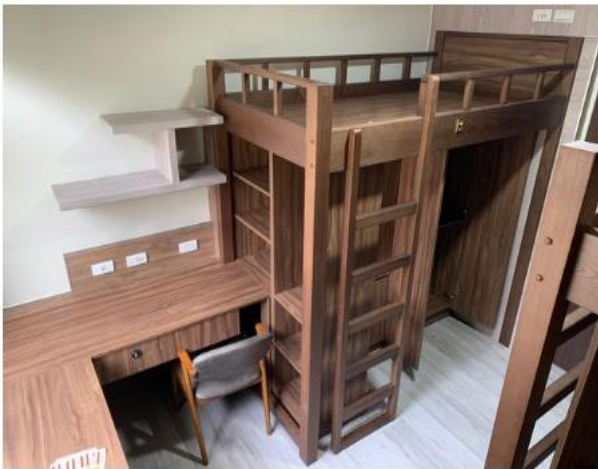
Pine House II Room Interior View(1)