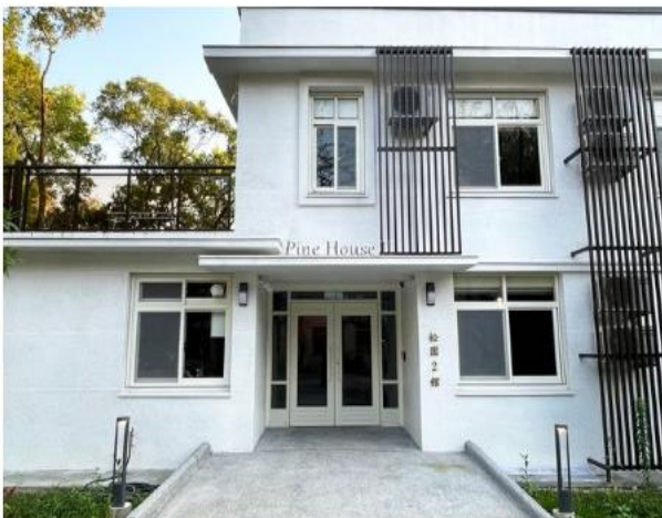
Pine House II Main Entrance and Building