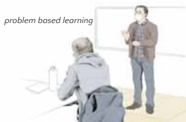
problem based learning